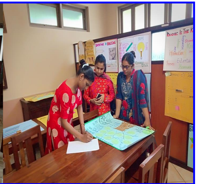
Teachers Judging Competition