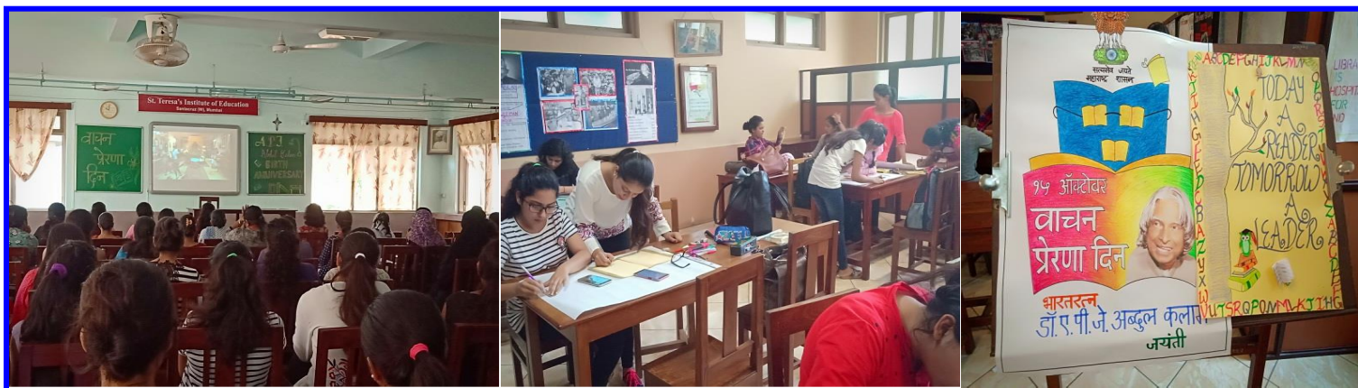
Movie: I am Kalam