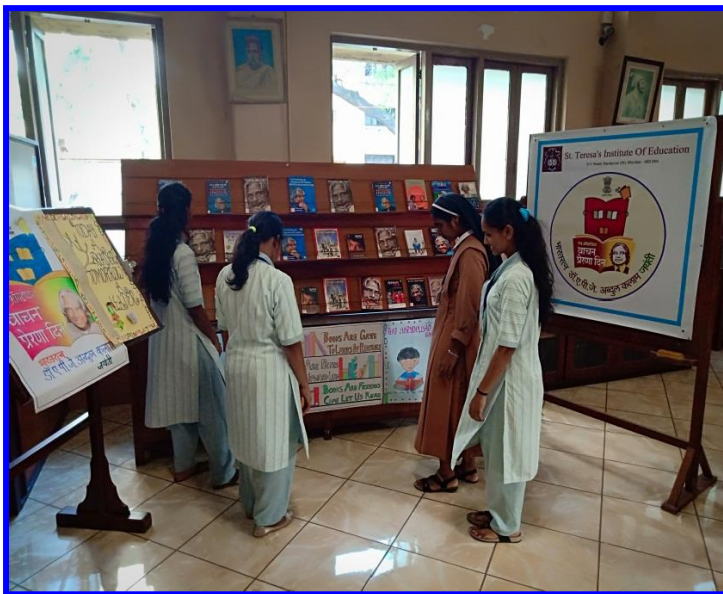
Book Exhibition: on and by Dr. Abdul Kalam