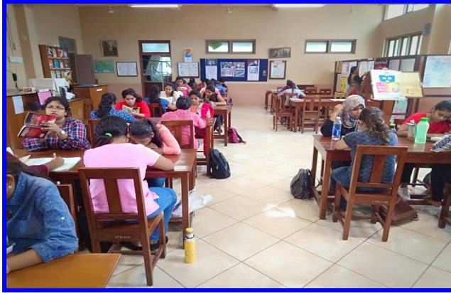
Group Reading in STIE Library