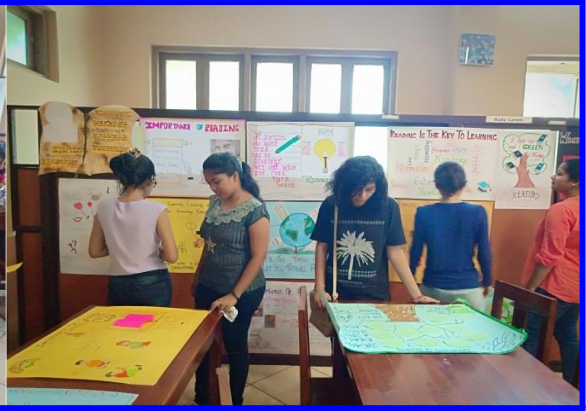
Chart Display: Importance of Reading